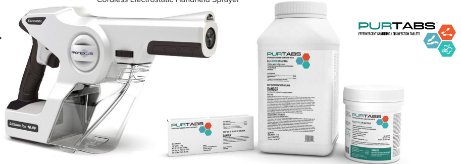
PX200ES Cordless Electrostatic Handheld Sprayer

WITH 360° ELECTROSTATIC SPRAYING COVERAGE