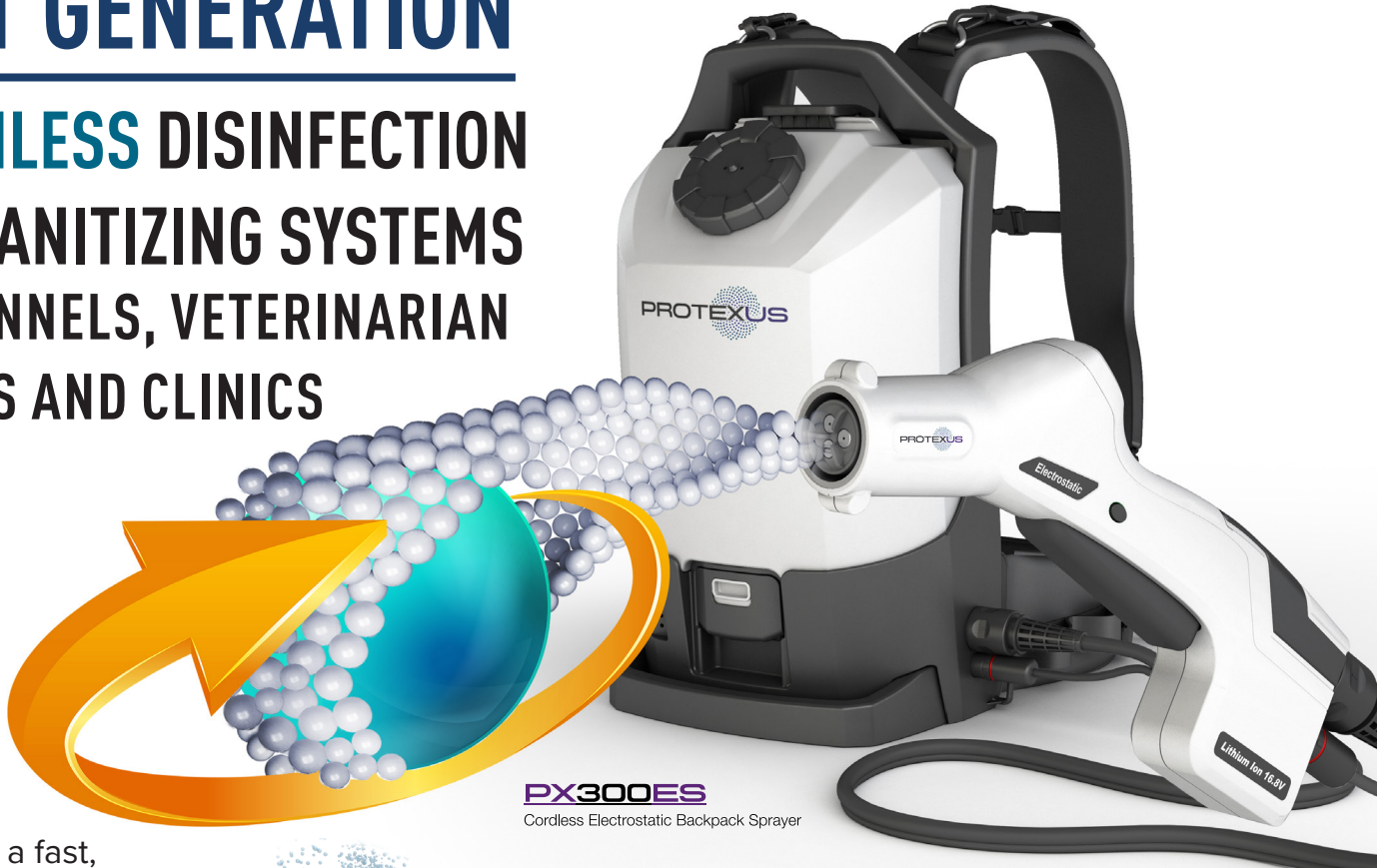
PX300ES Cordless Electrostatic Backpack Sprayer

Evaclean is a fast, economical and complete equipment and chemical solution for eliminating and preventing the spread of infections across facilities of all sizes and industry.