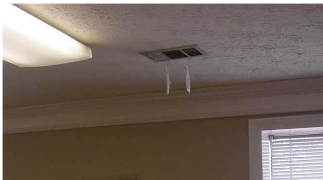
Figure 3: KennelSol® APS ClO 2 sachets suspended from ceiling vent

immediately switched to ON, and the air flow rate recorded. The flow pump rate through the impingers was 2.3 L/min for all experiments.